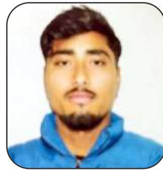
Best NSS Volunteer