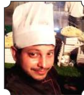
Mr. Nitish Kumar