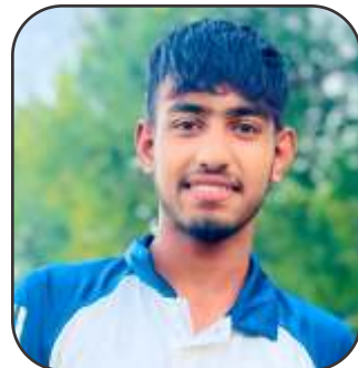
Smile Silver Medal Inter College Wrestling